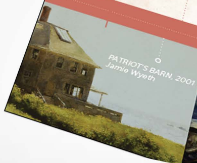
PATRIOT'S BARN, 2001 Jamie Wyeth