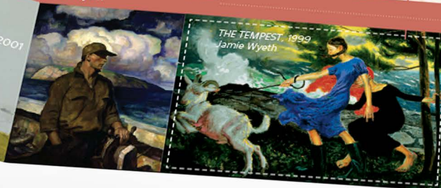
A YOUNG MAINE FISHERMAN, 1933 N.C. Wyeth