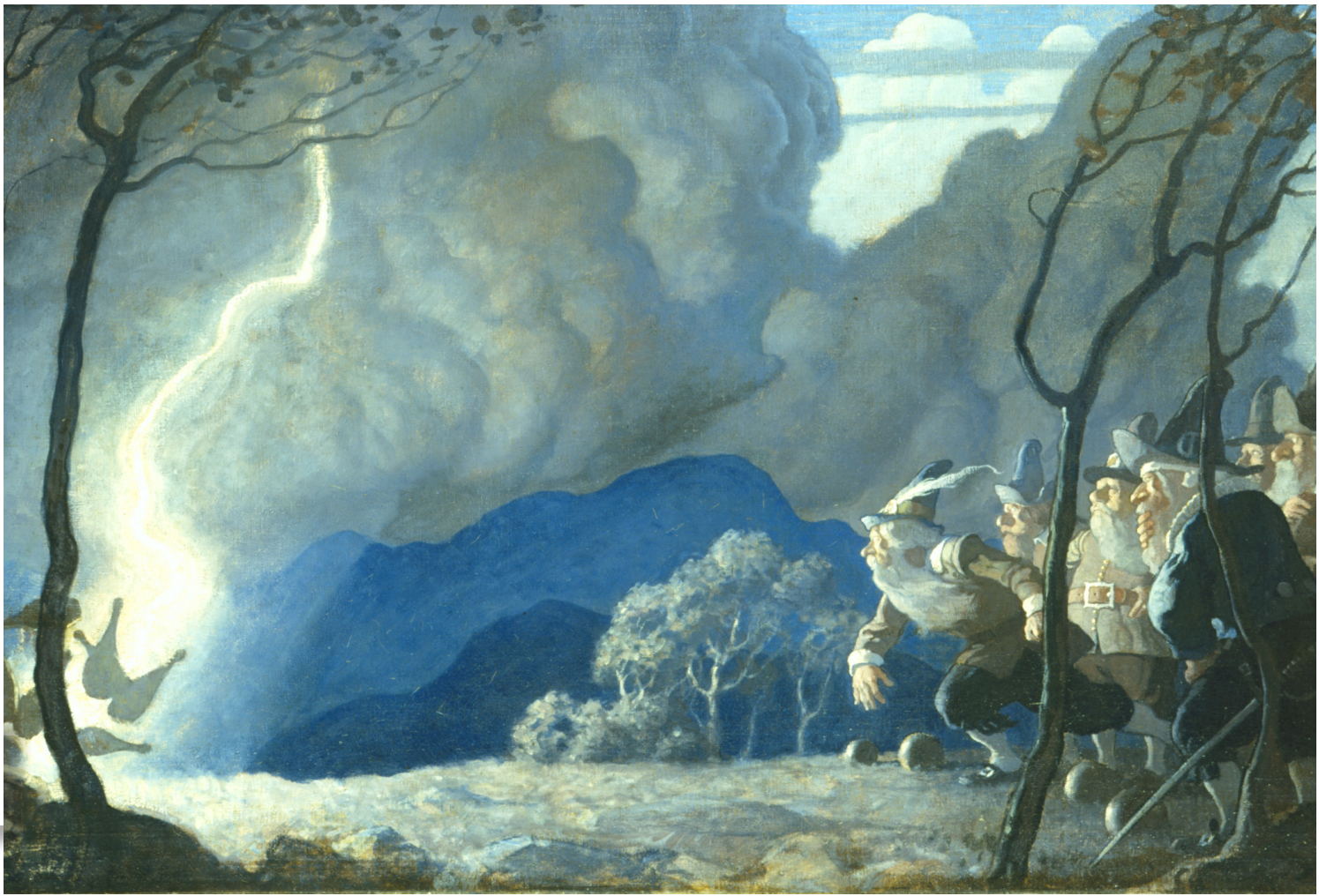
GNOMES BOWLING, 1921, N.C. Wyeth

AN EPIC JOURNEY THROUGH THREE GENERATIONS OF ART