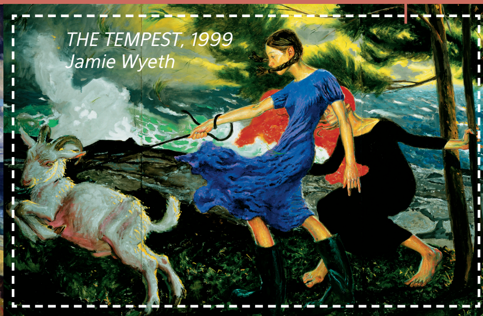
THE TEMPEST, 1999 Jamie Wyeth