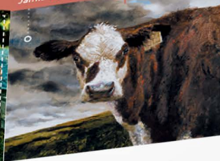
NUMBER 86, 1980 Jamie Wyeth