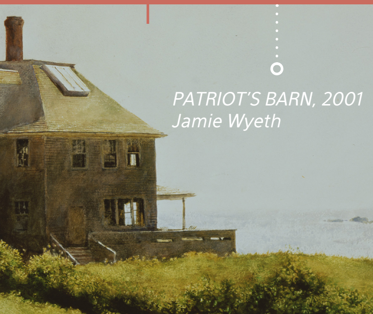
PATRIOT'S BARN, 2001 Jamie Wyeth